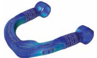
FEA result of the UCA showing Von Mises stress distribution illustrating the product design mitigates stress loading before material yield.

Blackhawk Ultimate Adjustable UCA passing fundamental testing processes.