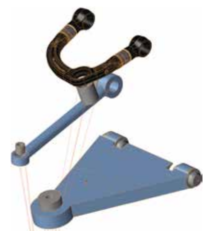
Simulated suspension for Finite Element Analysis showing all contact points to comply with NCOP VSB14 requirements.